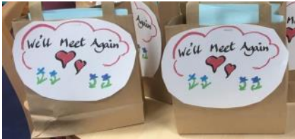
VE lunch bags

As ever the Day Centre Team went above and beyond to make the packed lunches special. A commemorative booklet, 'We'll meet again' label, bouquet and VE day biscuits were all part of the lunch bag.