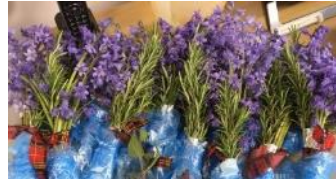
Beautiful bluebells and rosemary for remembrance