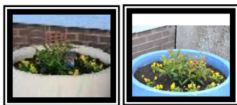
Before ... ..and after!

Our playground is looking even better especially the Willow Garden is now an even more appealing place to play. The willow has been pruned and trained into a fabulous den and our arch welcomes everyone into the natural retreat. Our planters have been refreshed and the blackboard has a fresh coat of paint ready for our creative illustrations.