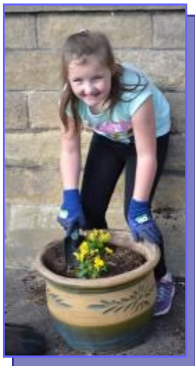
Planting up for some winter colour.

Our Campie Community have taken the lead in a number of fantastic events over the last few months.