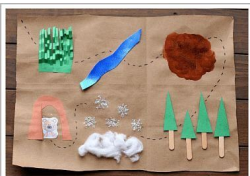
We're Going on a Bear Hunt MAP & BINOCULARS

Read the story or use the below link https://www.youtube.com/watch?v=0gyl6ykDwds Can you create... -your own map? Will you come across different obstacles? -some binoculars to spot any bears? -a bear cave?