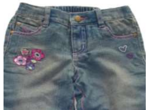
Jeans/trousers with buttons