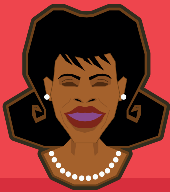
MICHELLE OBAMA INVESTIGATIVE

If you find yourself solving problems like lawyer and former First Lady of the United States, Michelle Obama then you might be the investigative type. You're curious, good at asking the right questions and like to observe and explore ideas.