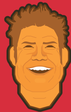
STEVE BACKSHALL PRACTICAL

Swimmer Ellie Simmonds used her organisational skills in her training regime to reach Paralympic glory! Jobs that organisers enjoy include working with data, planning or record keeping.