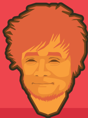
ED SHEERAN CREATIVE

Investigative people tend to like jobs which involve thinking, research or facts and figures.