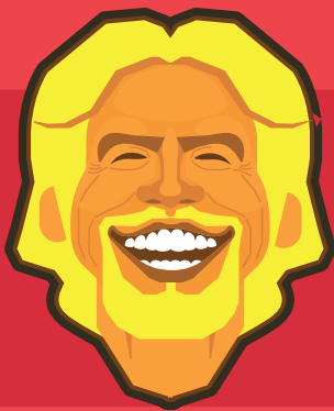
RICHARD BRANSON LEADER

Leaders like Richard Branson are confident and adventurous. You like making decisions and persuading others to see things your way.