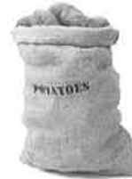
sack of potatoes