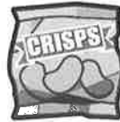
packet of crisps