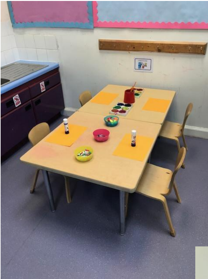
Our creative area - where you will be able to paint and glue.