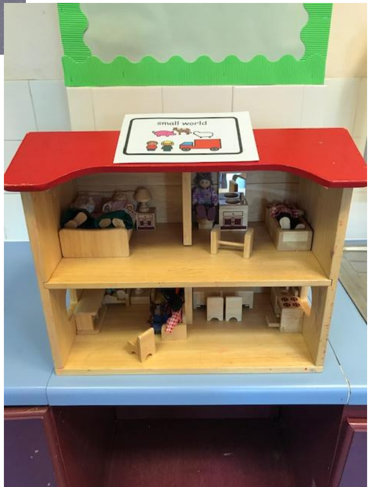
Small world - dolls house